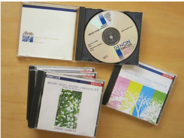
Fig. 5. The six Denon CDs that make up Ingrid Haebler's rendition of Mozart's sonatas. This wonderful piece of heritage is surely intangible: in fact, I do not really care about those CDs nearly as much as I care about the music itself –or, in other words, about the particular sequence of bits that make up for that recording.