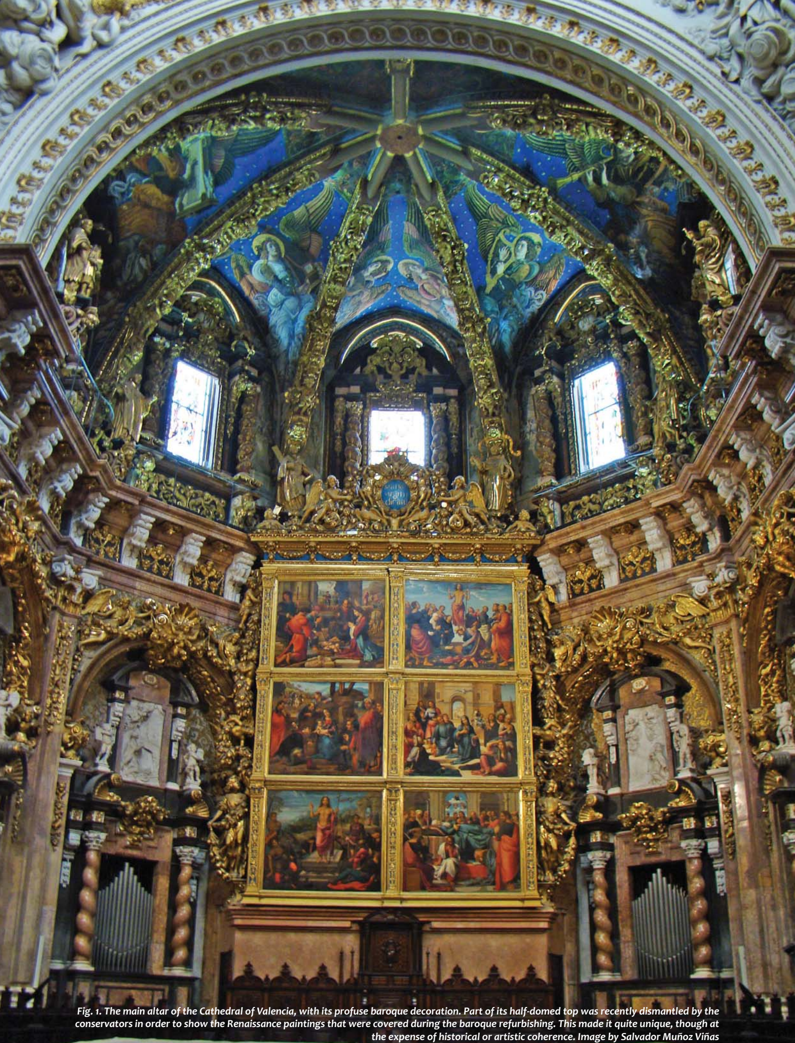
Fig. 1. The main altar of the Cathedral of Valencia, with its profuse baroque decoration. Part of its half-domed top was recently dismantled by the conservators in order to show the Renaissance paintings that were covered during the baroque refurbishing. This made it quite unique, though at the expense of historical or artistic coherence.