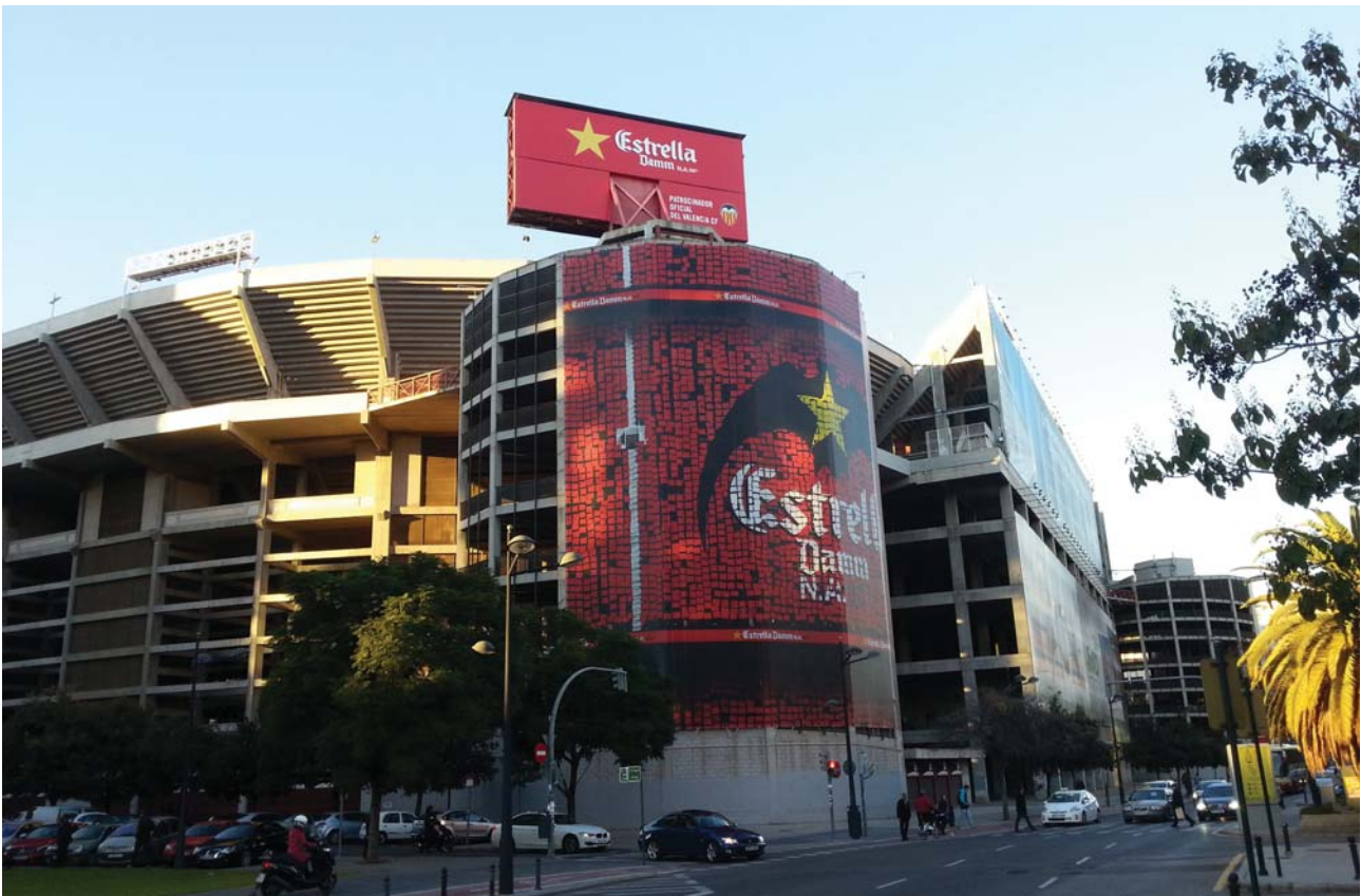
Fig. 3. The Eastern and Southern façades of Mestalla, the home stadium of Valencia Club de Fútbol.

memories than the cathedral of Valencia, memories that rank higher on my personal scale of emotional intensity. Mestalla, for instance.