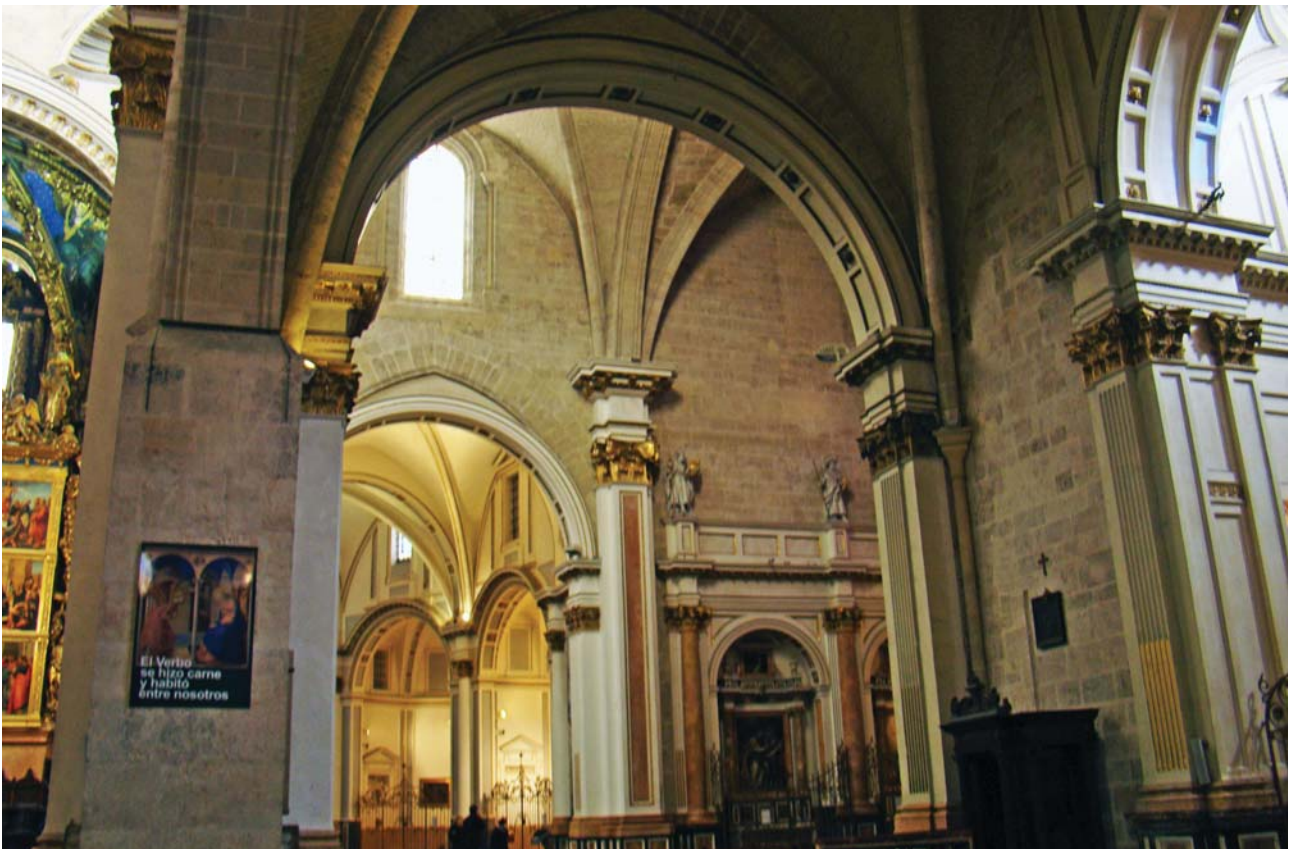
Fig. 2. A view of the Neoclassical side chapels of the Cathedral of Valencia. Most of the Cathedral was originally Gothic, but in the 17th and 18th centuries it was fully refurbished in the baroque and Neoclassical styles. In the 1980s, an important part of it was restored to its original Gothic appearance. The side chapels, however, retained the Neoclassical look.

me, Valencia's cathedral is interesting on aesthetic, historic and intellectual grounds, but it is also loaded with sentimental value. And, as it turns out, this can have a substantial impact on the value I assign to this particular object. I strongly believe that this is not exceptional, that factors of this kind play an important role when it comes to determining the values that spectators assign to any particular heritage.