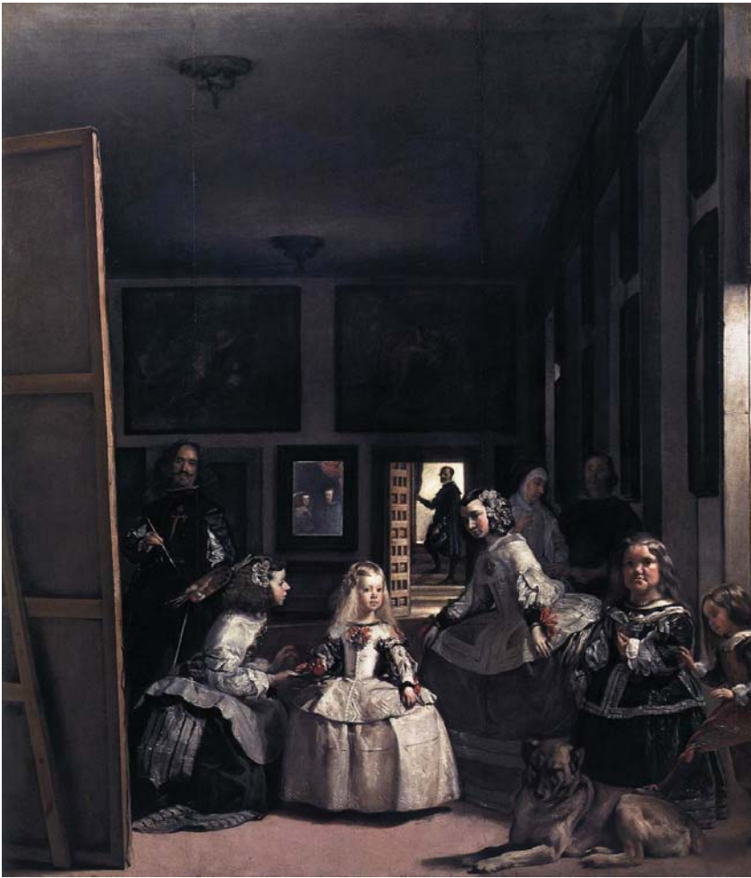
Fig. 4. Las Meninas. What we can now see is mainly the result of Velázquez's work (who painted it in 1656), but John Brealey and the conservators who cleaned it in 1984 also had an influence in how we can now see it.

languages and ceremonies, have become a part of heritage: these things, created and existing through being performed, make up for a part of what is presently known as “intangible heritage”. Just as there exist the “performing arts”, we could perhaps speak of “performing heritage”. To further complicate things, some tangible objects need to perform some actions in order to fully become heritage: a clock, an engine, a mobile by Calder, all may contribute to blur the line between tangible and intangible heritage.