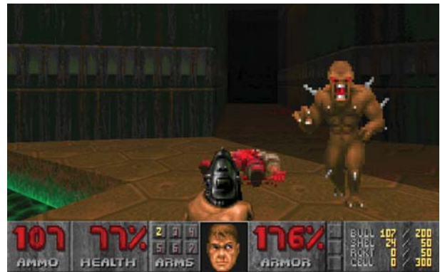
Fig. 8. Doom pioneered a new genre in the field of interactive audiovisual entertainment, the so-called “first-person shooter”. However, it is not mentioned here because of its historical relevance, but because of what it meant for the author of the paper.

After the Big Bang (the famous, original one), fragments of material began to coalesce into smaller, discrete entities –the identities we can identify, the identities we use to describe, analyse and, ultimately, understand the outer universe: galaxies, planets, stars, etc. In a way, the same thing is happening in the heritage world. Some fragments of the “heritage-at-large” universe have already started to coalesce: tangible heritage vs. intangible heritage; “world heritage” vs. local heritage; public heritage vs. private heritage; heritage as a whole vs. heritage property ;