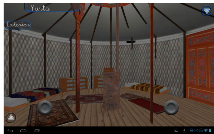
Fig. 2. Different screenshots of the “houses of world” 3D interactive app